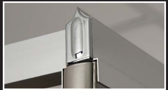
Bright dipped aluminum headrail to match chrome hardware for a coordinated uniform appearance.