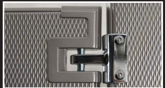
Heavy duty 3/8" diameter chrome plated pin with nylon insert for smooth operation.