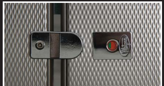
Concealed latch with "in use" two color indicator designed to provide emergency accessibility from the outside of the stall.