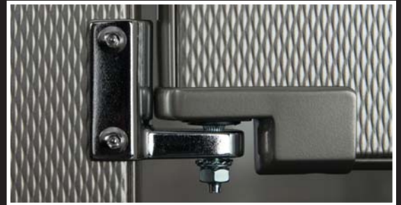
Unique NO RISE self-closing adjustable cam.